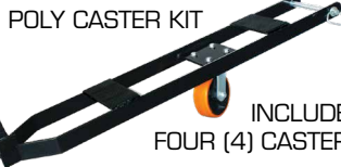
POLY CASTER KIT