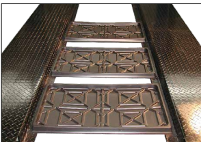
FOUR (4) DRIP TRAYS